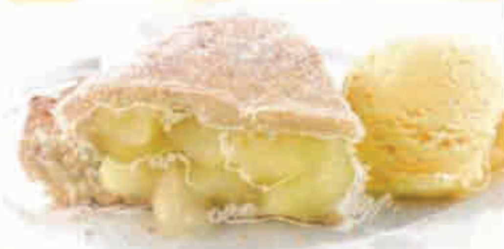
Bramley Apple Pie

Tea and coffee available – please ask a member of staff for details.