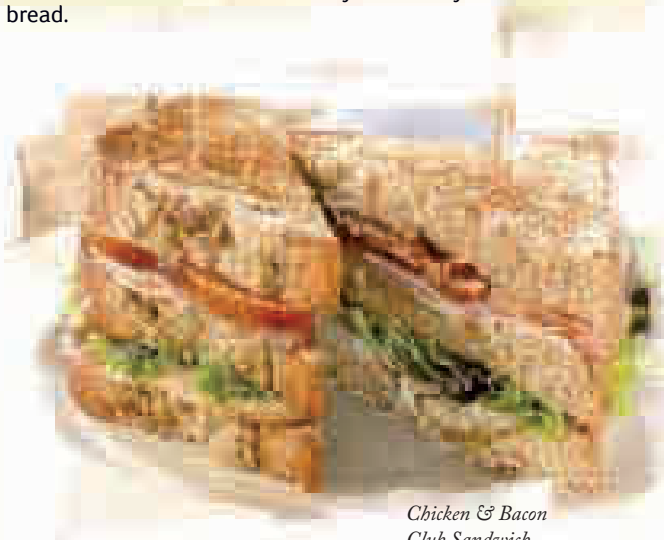
Chicken & Bacon Club Sandwich