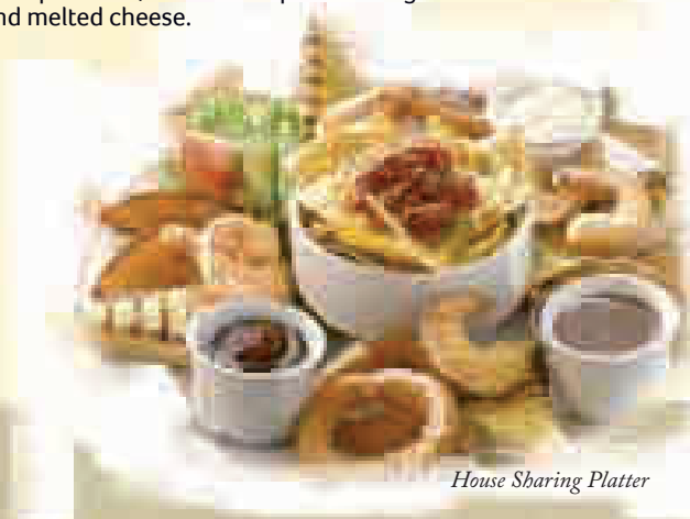
House Sharing Platter

£1 OFF All Sharers Monday - Saturday 5 - 8pm Excludes Burger Platter